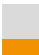
1/3 page 200×87 mm horizontálně