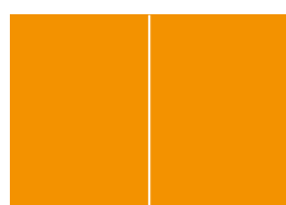
Doublepage 400×270 mm