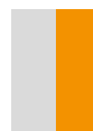
1/2 page 98×270 mm vertikálně

Digital files accepted: PDF, EPS or TIFF. All images should be saved in CMYK format; 300 dpi resolution at actual print ad size, all linked files and fonts must be included. Bleed at least 3 mm and safe area at least 5 mm all around.